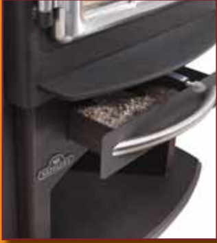
Convenient ash pan