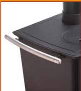
Pot fenders keeps food safely on the surface