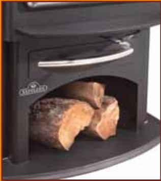
Wood storage compartment