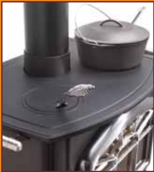
Reliable cook top surface